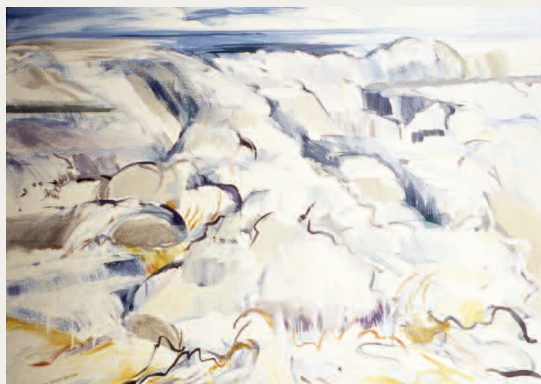
HILDA GREEN DEMSKY CADENCE 2007, OIL ON CANVAS, 30 x 40 IN. $1,800 FROM THE ARTIST