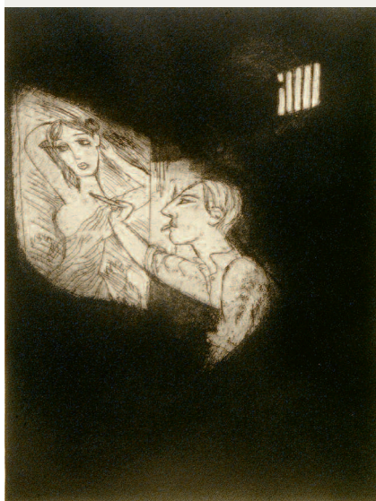
RUTH CHANNING THE FORGER 2007, ETCHING, 28 x 22 IN. $800 FROM THE ARTIST